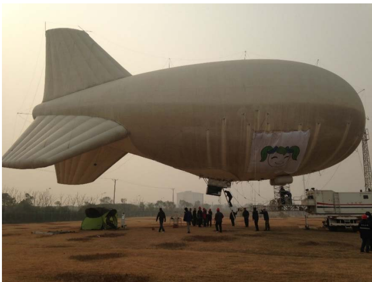
Photo: Balloon used by Shanghai's Environmental Monitoring Center to collect air quality data from an elevation of up to 1000 meters.