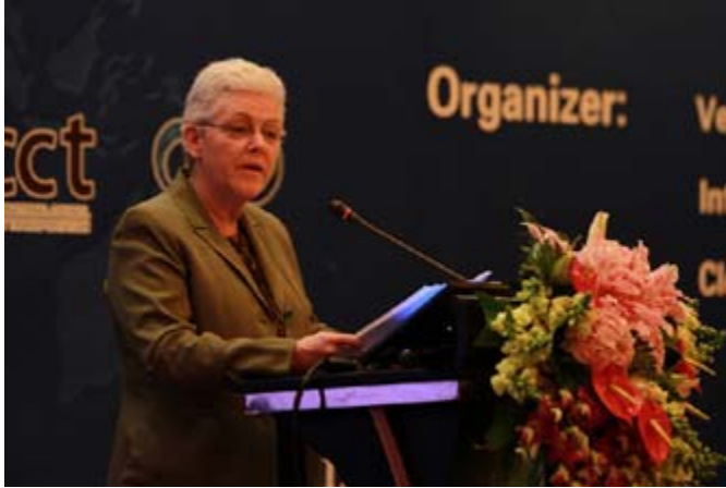
EPA Administrator Ms. Gina McCarthy

US Environmental Protection Agency administrator Gina McCarthy spoke at the meeting and said that precisely because of the implementation of ultra-low sulfur fuel it has been possible to further implement more stringent motor vehicle and engine standards in the United States. She said that clean fuel and more stringent emission standards can also help China apply more advanced vehicle emissions control technology to further reduce emissions. The two countries should strengthen