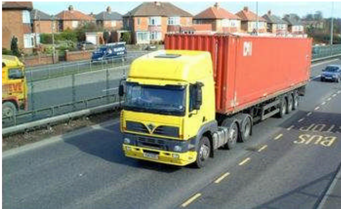
Heavy goods truck in England

Transport Minister Mike Penning said that the trials will be supported with £9.5 million (US$15.4 million) invested by the Department for Transport and the Technology Strategy Board. "This competition will help drive down emissions from trucks," said Penning. "Almost a quarter of carbon from transport in this country comes from heavy goods vehicles, so this is a key area for us to tackle."