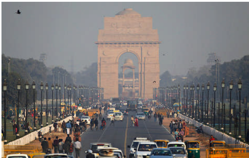
New Delhi memorial India Gate, glimpsed through the haze in a December, 2011 photograph.

India has the worst air pollution in the entire world, beating China, Pakistan, Nepal and Bangladesh, according to a study released during this year's World Economic Forum in Davos.