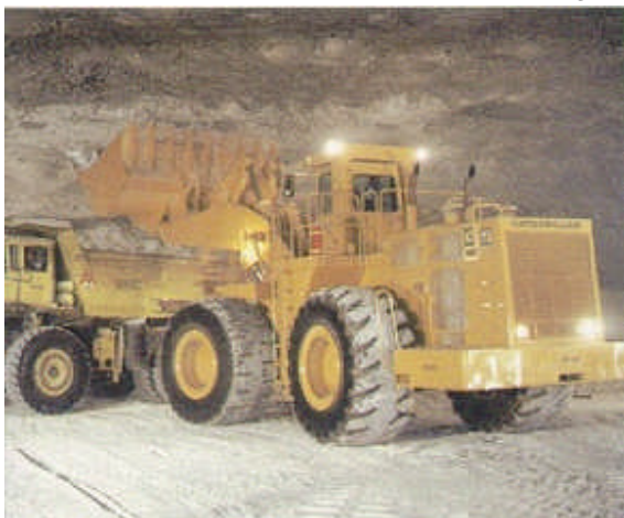
Diesel-powered equipment used in underground mining

Heavy diesel exhaust (DE) exposure in humans may increase the risk of dying from lung cancer, two new papers have revealed. Starting in the 1980s, studies have investigated a possible causal relationship between exposure to diesel exhaust and lung cancer.